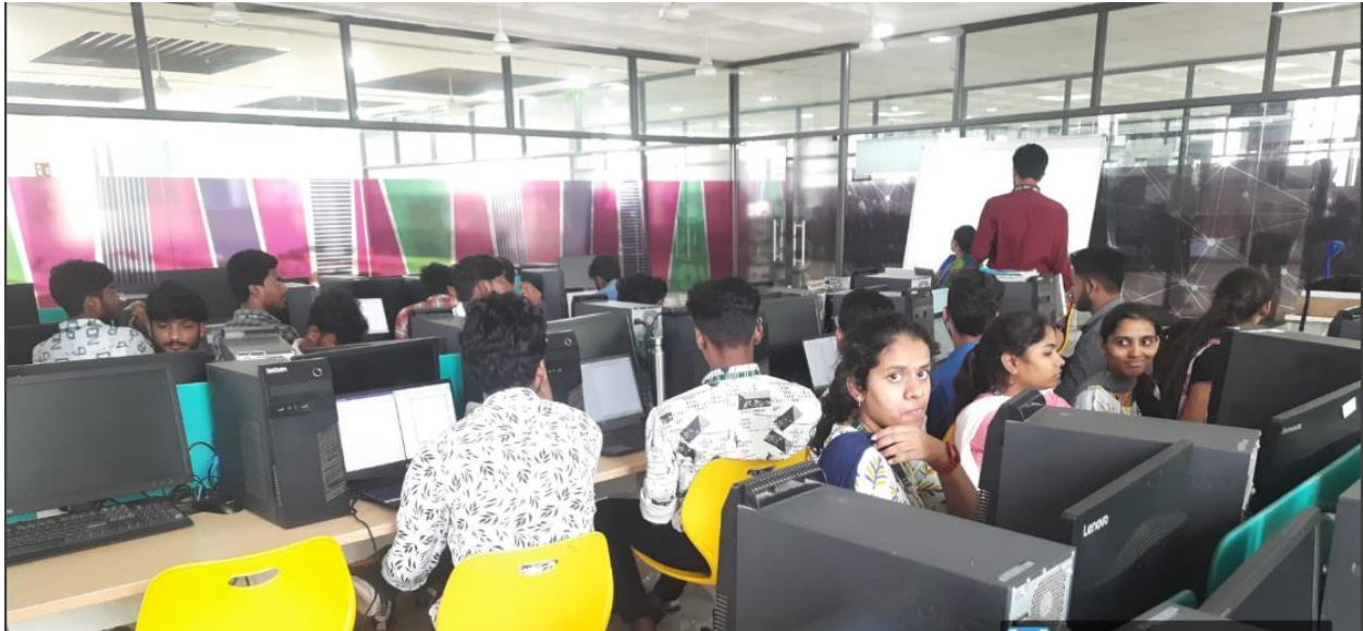
Automation Essentials: From Theory to Implementation at R604 on 13-12-2018